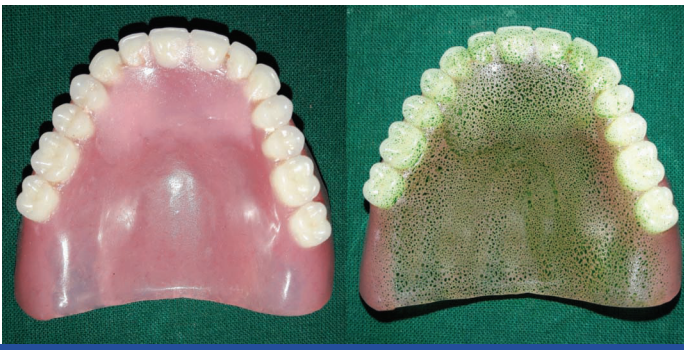
[Table/Fig-7]: Polished denture with functional palate with polymerised resin in deficient area.