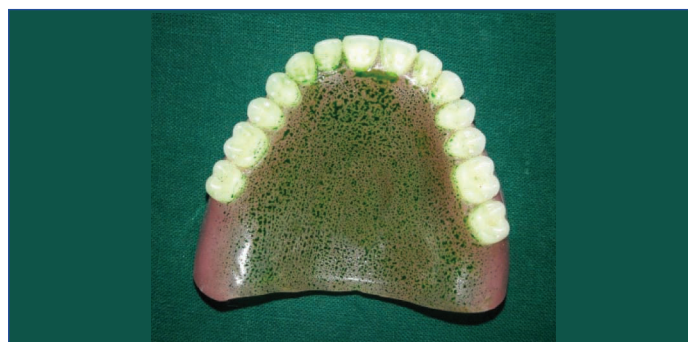
[Table/Fig-1]: Evenly sprayed palatal area with green food colour liquid which immediately dries.

Next the maxillary complete denture was evenly and uniformly sprayed with green coloured liquid, obtained by mixing edible food colours [Table/Fig-1]. Green colour was specifically chosen, as it imparted visually appreciable contrast against denture base. It was then inserted in patient's mouth and correctly seated, taking appropriate caution that the sprayed palate did not touch elsewhere, before the sound was pronounced. Patient was asked to repeat