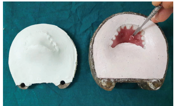
[Table/Fig-5]: Denture with customized palate flaked with plaster and a plaster key-way prepared.