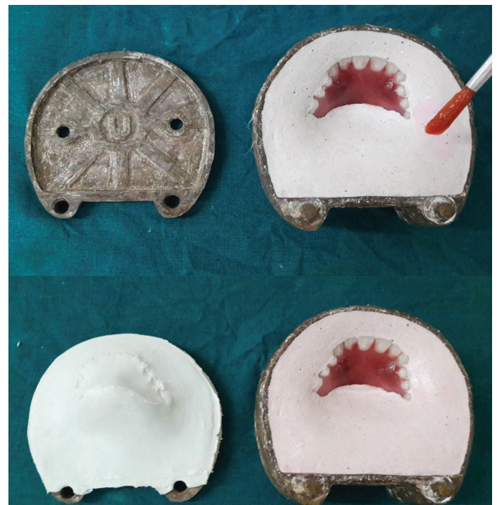
[Table/Fig-5]: Denture with customized palate flaked with plaster and a plaster key-way prepared.

B. Violet outlined area shows under- contoured part of palate.