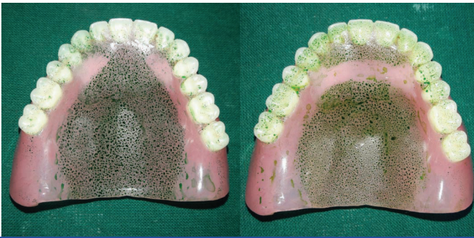
[Table/Fig-8]: Verified palatograms for "S" and "T" sounds.

Anterior teeth positioning, occlusal plane, vertical dimension of occlusion and palatal contour altogether, work on tandem and ensure optimum phonetics in complete denture. Palatal contour thus remains as the sole factor influencing speech, when other three factors are physiologically and mechanically accurate or well compensated [2,3]. Proper pronunciations require accurate approximation of tongue with the palatal contour. Intelligible speech, especially the sibilant sounds, requires normal motor function of tongue musculature and a customized palatal contour having dynamic tongue impression. In treatment with complete dentures, aesthetics, function, retention and comfort are harped upon at every step of denture fabrication, but phonetics is more often than, mistakenly an ignored facet! [4,5].