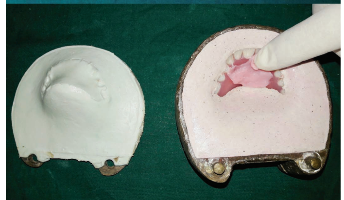
[Table/Fig-6]: Tissue conditioner removed and dough of auto-polymerised resin added to deficient area.

insertion, patient was asked to repeat the defective sounds “so”, “to”, “sho” repeatedly for 10 minutes at a faster rate, so as to record the tongue activity during speech. The bulk of tissue conditioner was contoured to functional anatomy by tongue and a customized anterior palate was obtained [Table/Fig-4]. After validating the clarity of sibilant sounds, denture was removed from patient’s mouth. Waxed trial denture was processed normally after this maneuver.