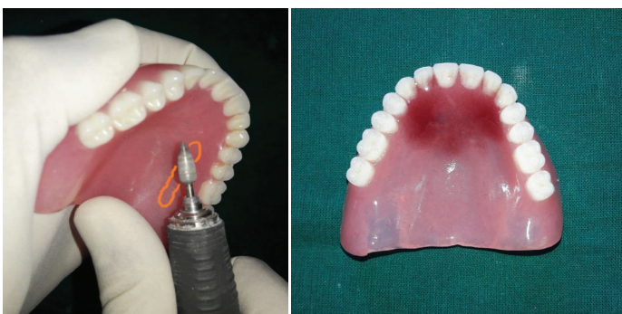
[Table/Fig-3]: Over contoured area is selectively trimmed. [Table/Fig-4]: Tissue conditioner with added red colour for contrast adapted to deficient area after prolonged speech.